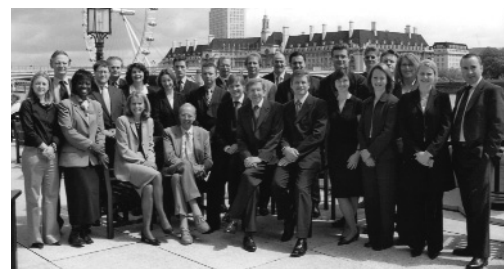
Parliamentary Study Programme delegates July 2004

General Manager, Broadband and Product Marketing, BT