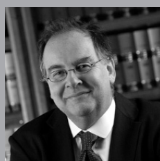
The Rt Hon the Lord Falconer of Thoroton QC Secretary of State for Constitutional Affairs and Lord Chancellor

The Rt Hon Michael J Martin MP Speaker of the House of Commons